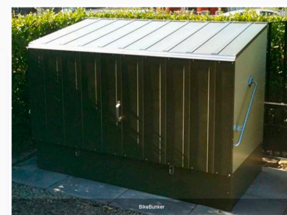
Generic Lockable covered cycle store for 2 Bicycles for Plot 1B.