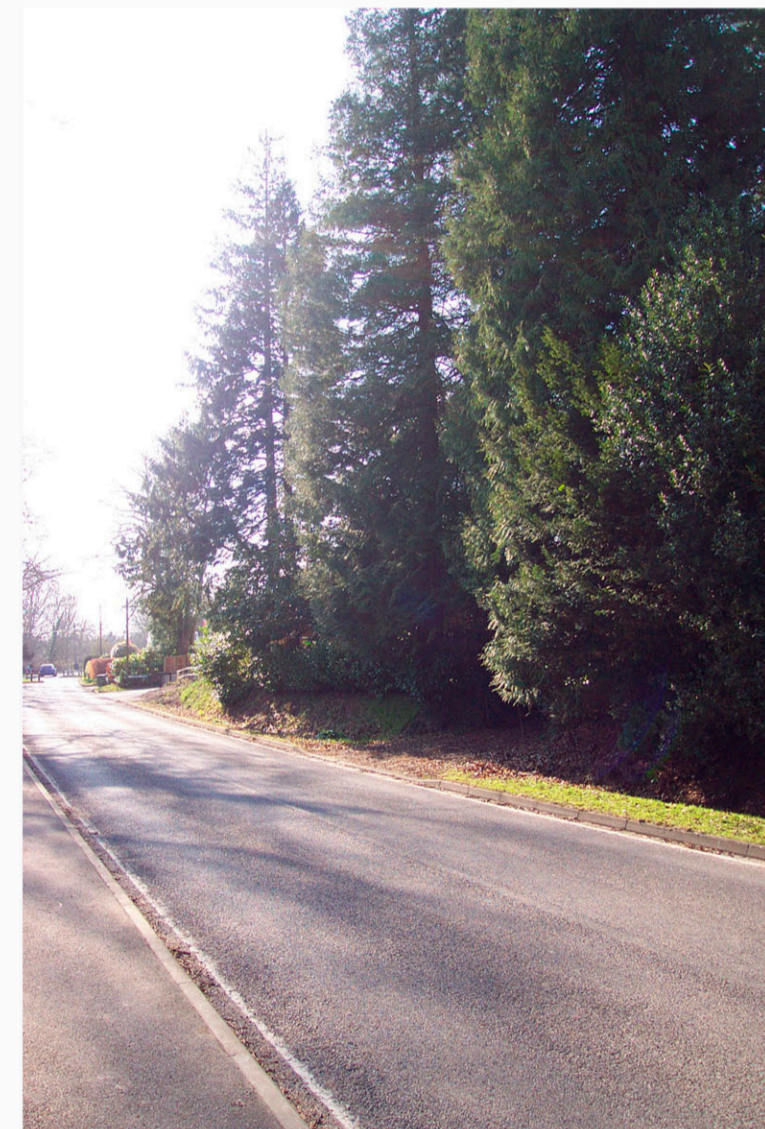
Existing Site Entrance from Harts Lane